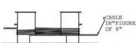
FIGURE A (CABLE LOAD = SWL) CABLE WOUND IN "FIGURE OF 8" AND POSITIONED UNDER THE SEPARATOR: CABLE LOAD=SWL